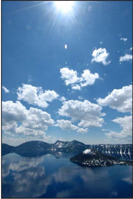
Volcanic Crater Lake, located in south-western Oregon, is the deepest lake in the United States. The lake is featured on one of Oregon's specialty license plates.

Crater Lake National Park is host to a diverse array of activities. While enjoying the natural scenic wonders, park visitors may hike in old growth forests, participate in a variety of interpretive activities, camp, stay in a historic hotel, or even cross-country ski during the long winters.